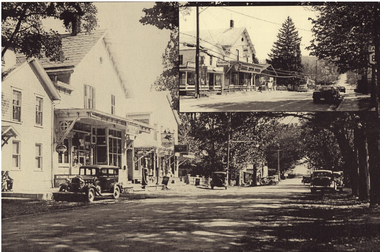
East Main Street, Greenville Stories and memories at the July meeting