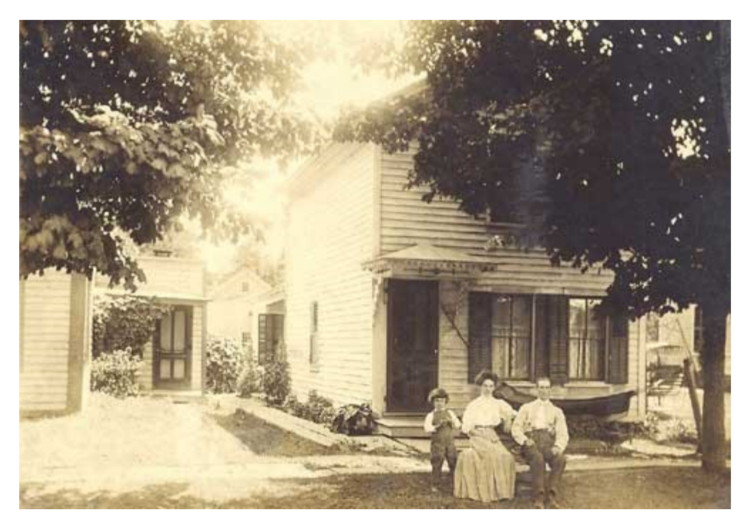
From the 2017 calendar. This structure is still there, as are the houses on the sides. A clue: the house on the left sits on one of the corners on one of the hamlets in our town. The answer will be revealed at the meeting, or if you buy a calendar. (shameless promotion!)