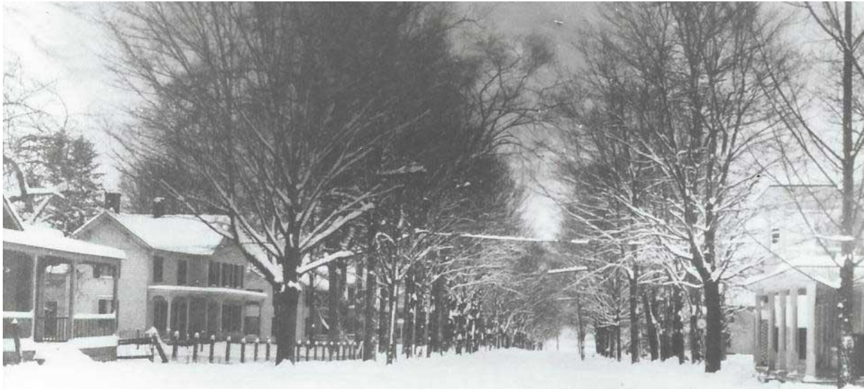
Possibly 1920s: looking south on South Street; not visible is the Corner Restaurant off left edge, and Greenville Hotel off right edge

structures are the ones both commonly used and at times arbitrarily designated):