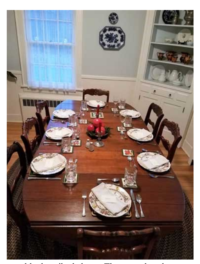
table described above. There are drop leaves on each end. Its four leaves that are of the same wood as the rest of the table. When fully opened up, the table can accommodate ten, with one person seated at each end. We do not have to turn this table diagonally when it is fully opened. Unfortunately, none of us remembers where our mother got this table or who refinished it. (Two local possibilities: Darius "D.H." Rundell or Walt Smith.) If only the tables could talk, who knows what tales they would have to tell us?

2. We believe our mother purchased the Turner table that now sits in our dining room sometime in the 1970s. [See photograph] This table is smaller, oval in shape, more to scale for the room, and "fancier," or at least less utilitarian appearing than the